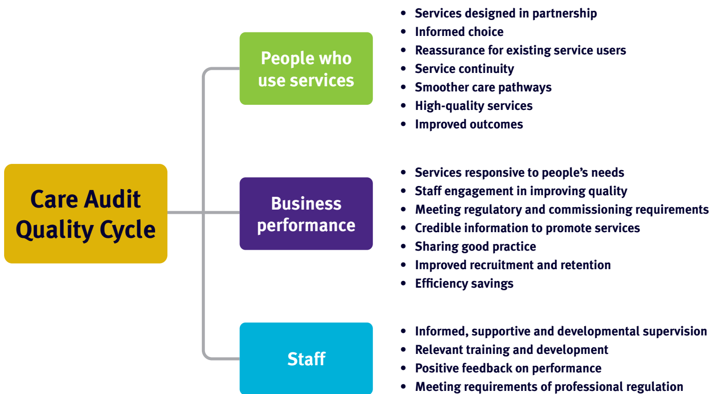
Benefits of care audit for people who use services, staff, and performance