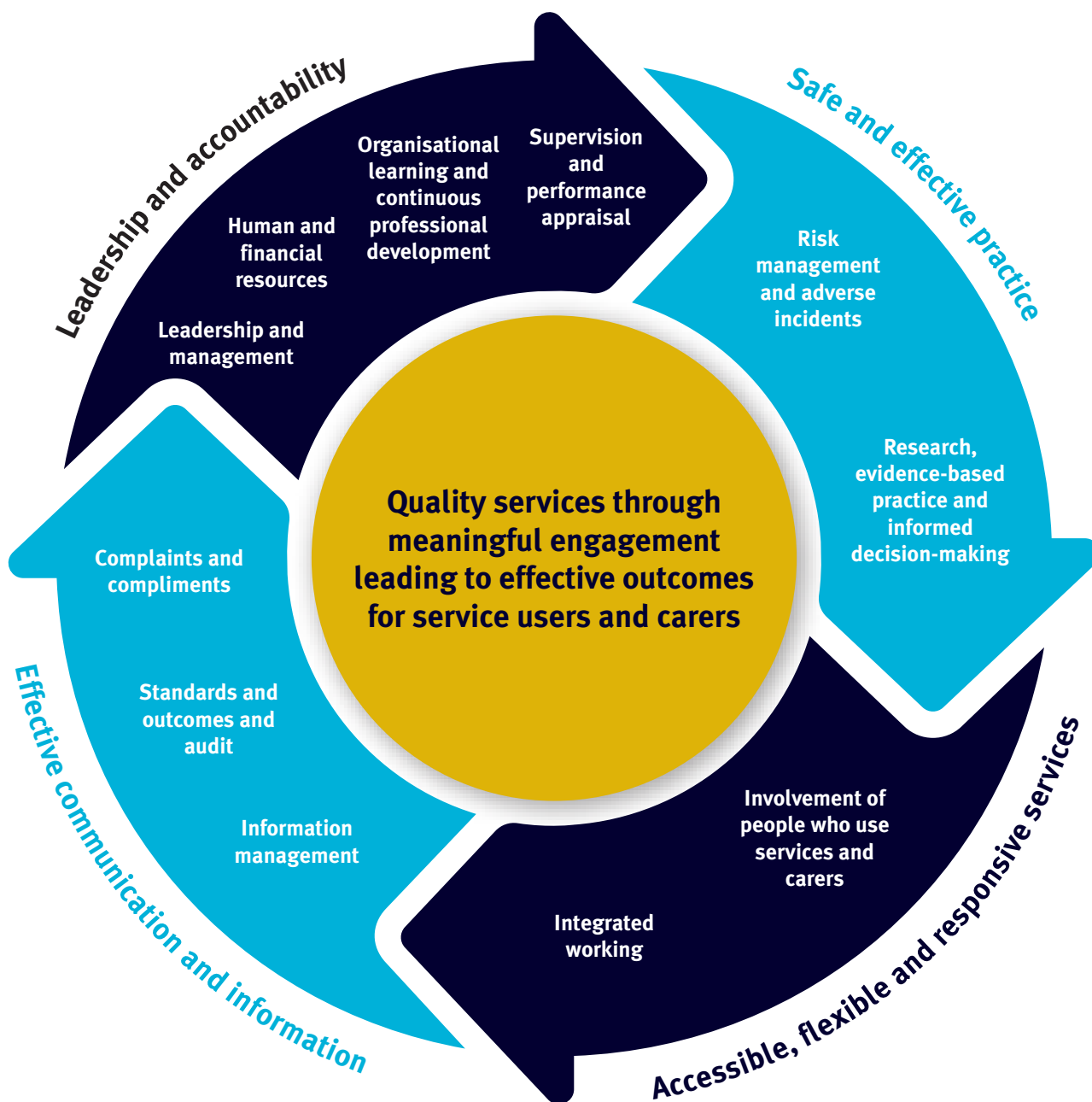
A model of social care governance

The diagram below presents a model of social care governance for quality services, from Social care governance: A practice workbook (SCIE, 2013) :