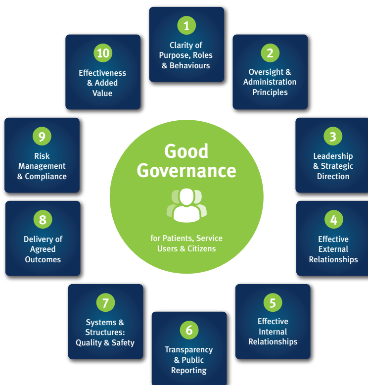
Figure 1. 10 Key Elements of Good Governance

This guide sets out 10 key elements of good governance that support the delivery of high quality care for patients, service users, citizens, and stakeholders, ensuring optimal use of resources.