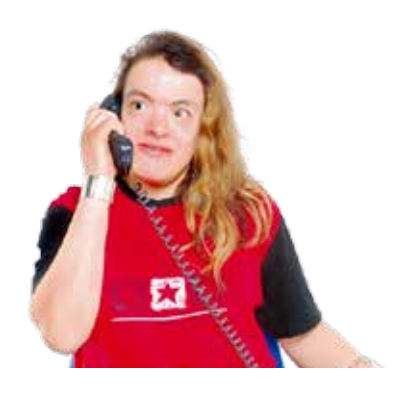
How this Works...

Anyone can tell us about the death of someone with learning disabilities